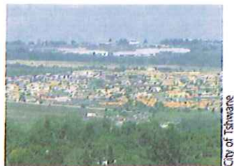
City of Tshwane

Key role players City of Tshwane Urban Planning M&T Commercial Development Abland VCR Properties Centurus Holdings Retail Africa